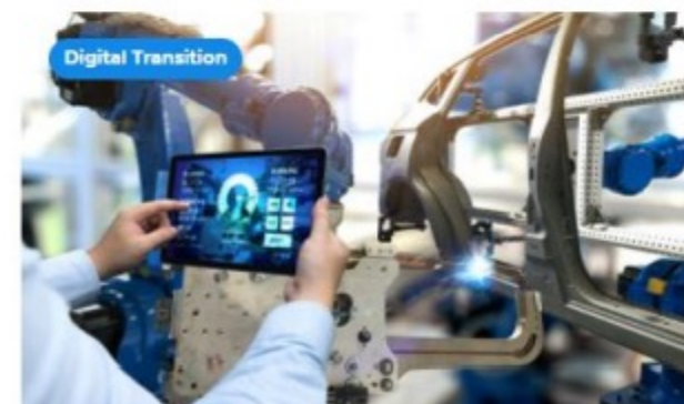
AI for the Netherlands