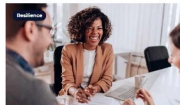
A*STAR Partners' Centre (A*PC)