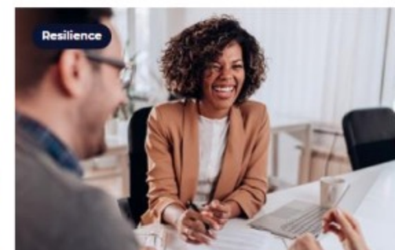
Alliance Free Economic Zone (Alliance FEZ)